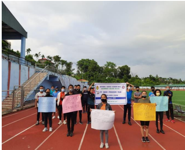
(Special Camping at Meidum, Kolasib District)